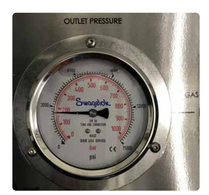
We test up to 350 bar