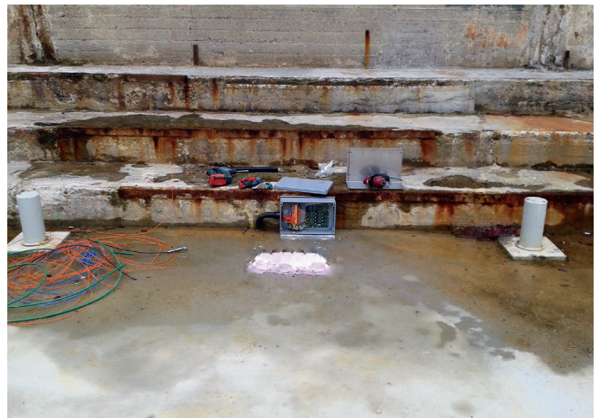
Installation of a durAcenter (the grey box). The durAcenter is a control system, communicating with the central control cabinet.