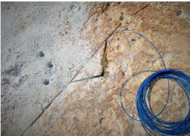
The 1338 durAnodes are connected with a titanium wire. A total of 632 m of wire was in the process.