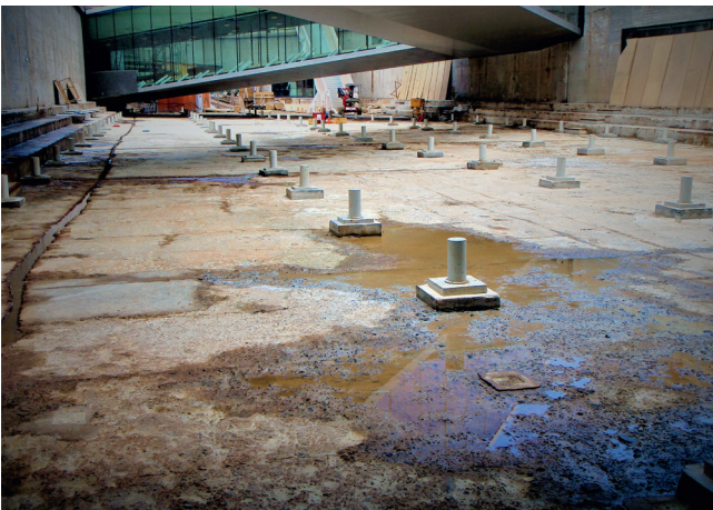
The base slab layer of the Maritime Museum of Denmark ready for installation of cathodic protection.