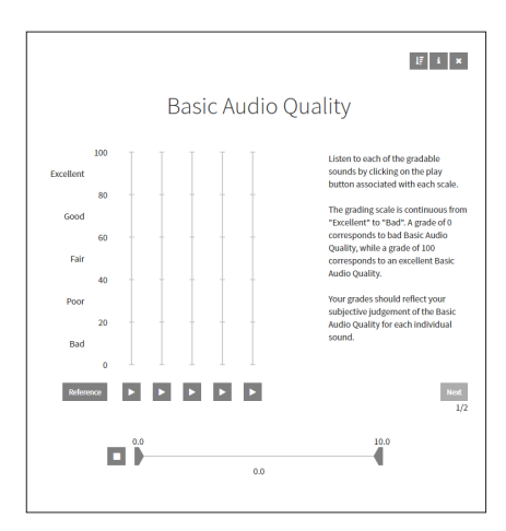
The SenseLabOnline implementation of the MUSHRA test facilitates easy gathering of data.

The ITU-R BS.1534-3 Multi Stimulus test with Hidden Reference and Anchor (MUSH-RA) [1] test is intended for the assessment of intermediate audio quality. Further, the method has shown to provide a reliable and repeatable measure of the audio quality of systems in a variety of technology domains.