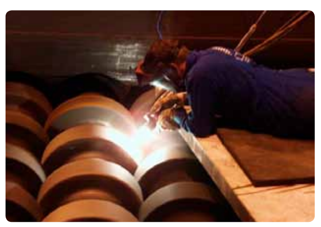
Repair by thermal spraying of large and costly application on-site