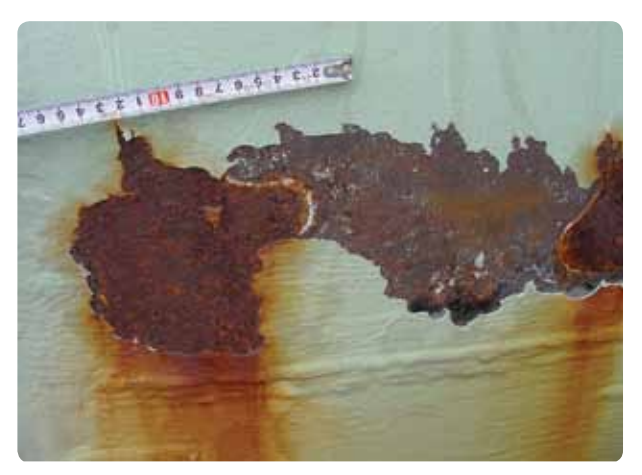
Investigation of corrosion attacks