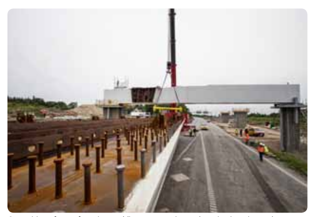
Supervision of manufacturing, welding, construction and coating is an integral part of the contract