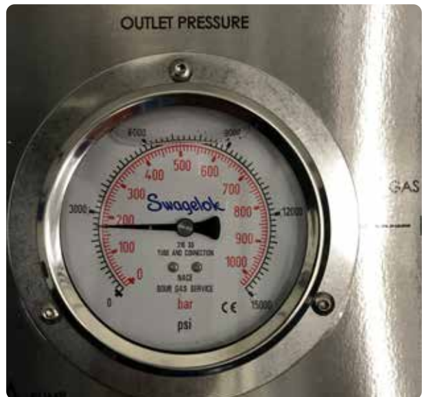
We test up to 350 bar

Cecilia Kjartansdóttir: Tel. +45 42 62 77 54 / E-mail: cekk@force.dk Mehdi Banisi: Tel. +45 42 62 75 69 / E-mail: meba@force.dk